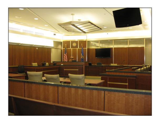
A technology-enhanced courtroom in the new Washington County Courthouse, completed in August 2009.

Judges and court staff moved into the new Washington County Courthouse in August. Work continues to refurbish the old court space, which, when completed, will provide additional court space.