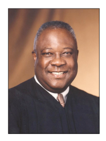
Court of Appeals Chief Judge Edward Toussaint, Jr.

The Minnesota Court of Appeals provides citizens with prompt and deliberate review of all final decisions of the trial courts, state agencies, and local governments. Court of Appeals' decisions are the final ruling in about 96 percent of the 2,400 appeals filed every year.