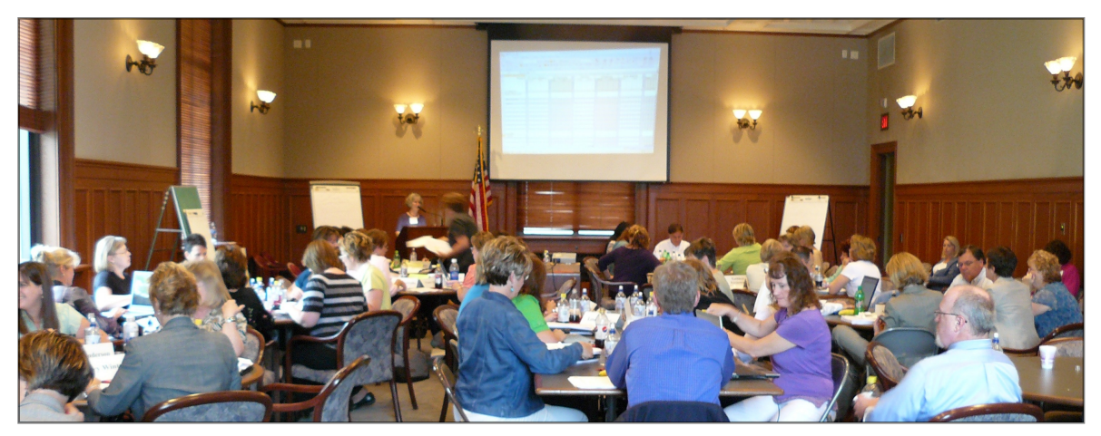
Court staff from around the State of Minnesota meet at the Minnesota Judicial Center to prepare for the rollout of the Court Payment Center.

In 2008, the Judicial Council, the Judicial Branch's policy-making body, formed a committee to study current court practices and recommend changes that would improve case processing and make more effective use of the Branch's limited resources. Several of the resulting recommendations involved the implementation of new technology.