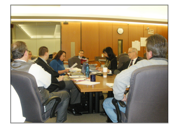
Minnesota State legislators observe a Hennepin County Drug Court conference.

Similar problem-solving strategies are being used with cases that involve defendants with chronic mental health issues, juvenile truancy, domestic violence, and community disputes. 2010 will see