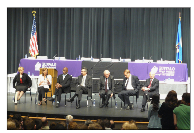
Members of the Minnesota Supreme Court answer student questions during a visit to Buffalo High School.

In May 2009, the Supreme Court's traveling oral argument program was held at Buffalo High School. The court visited Hibbing High School in October. A community dinner attended by more than 150 area citizens was held at St. Leo's Hall in Hibbing in conjunction with the visit to Hibbing High School.