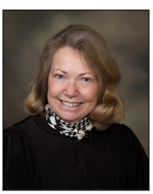
Court of Appeals Judge Harriet Lansing

An innovative Minnesota Court of Appeals pilot program promises to decrease conflict levels for families involved in appellate litigation, decrease the time on appeal and achieve more satisfying outcomes for litigants. The Family Law Appellate Mediation pilot program began on September 2, 2008.