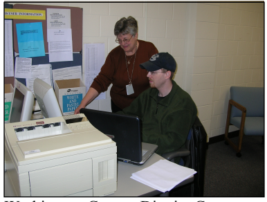
Washington County District Court Self-Help Center.

To simplify access to the courts for the tens of thousands of people who go to court without legal representation (pro se) and to improve the operational efficiency of handling pro se cases, the Minnesota Judicial Branch launched a statewide virtual Self-Help Center. This virtual service includes a robust Self-Help Website, and the option to get one-on-one help via telephone and email from three court staff who are specially trained in educating people about the law, court forms and procedures and making referrals to legal advice resources. The public can use the virtual Self-Help Center from anyplace with Internet