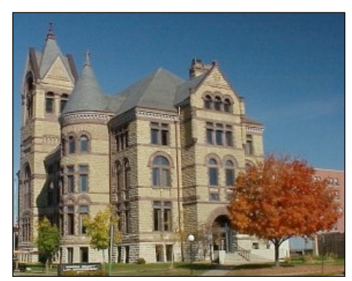
The Winona County Courthouse was completed in 1889. In 1970, the courthouse became the first Minnesota courthouse to be placed on the National Register of Historic Places.

Judicial Districts: 10 Number of Judicial Branch hearing facilities: 101 Oldest Courthouse: Washington County Courthouse, 101 West Pine Street, Stillwater, 1869. Number of Courthouses on the National Register of Historic Places: 62