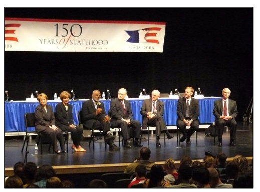
The Supreme Court takes questions from Hopkins High School students following oral arguments.

Twice each year the Supreme Court holds oral arguments in high schools. The arguments are followed by a question and answer session where the justices interact with local students, share lunch with high school students, participate in classroom visits, and host a community dinner open to the public during the fall visit.