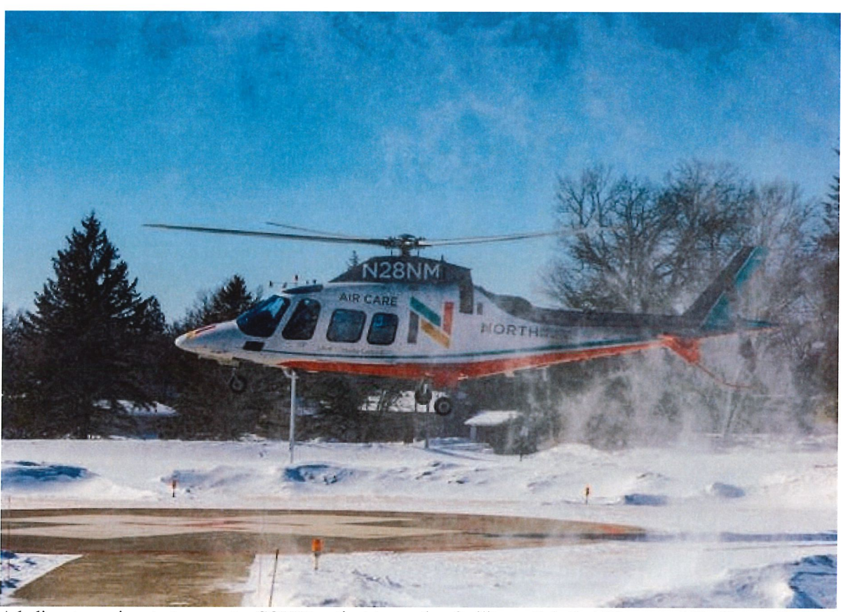
A helicopter arrives to transport a COVID patient to another facility on Feb. 2 at Riverwood Healthcare Center in Aitkin, Minn.

"We're always optimistic, but then it seems like the ripple comes back," she said. "So hopefully, hopefully it is."