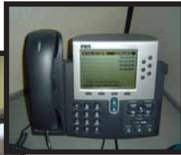
New phones, too!