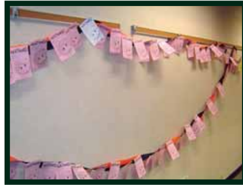
At left: dozens of the 150 Ovations received from internal and external customers noting thanks and appreciation for District Court employees hang on display at the celebration hosted by the EAR Committee on October 26, 2006.