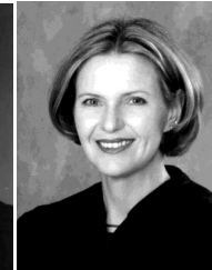
Judge Renee Worke