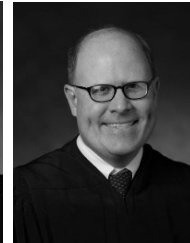
Judge Frank Connolly