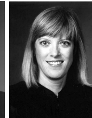
Judge Jill Halbrooks