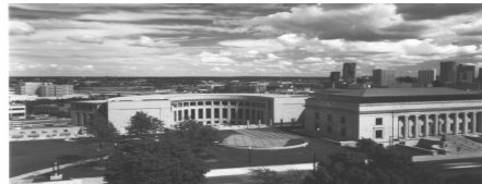
Minnesota Judicial Center, St. Paul