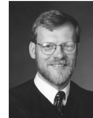
Judge Randolph Peterson