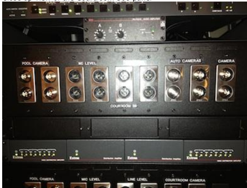
Close up view of the Courtroom 300 panel

Below the monitor is the audio amplifier. Just like the monitor, it does not impact what comes out the audio connections below. It only controls the volume to the speakers amplifying the audio. Turn it on by setting the switch to the up or "1" position). Adjust the volume knobs so you can hear the feed over the chatter of the press in the room.