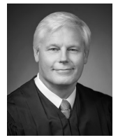
Justice Paul C. Thissen Appointed 2018