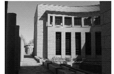
Minnesota Judicial Center, St. Paul

The Supreme Court grants review of approximately 12 percent of the 600-700 petitions it receives each year. The Court hears appeals from the Minnesota Court of Appeals, the Workers' Compensation Court of Appeals, the Tax Court, as well as election matters. The Court also automatically hears all first-degree murder appeals from the district courts.